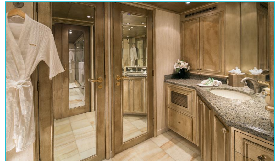
Master En Suite