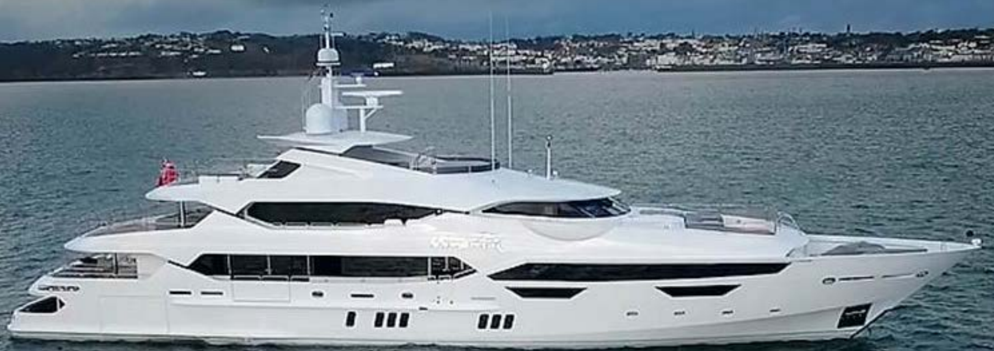
Princess AVK | 47.25m/155' | Sunseeker | 2016