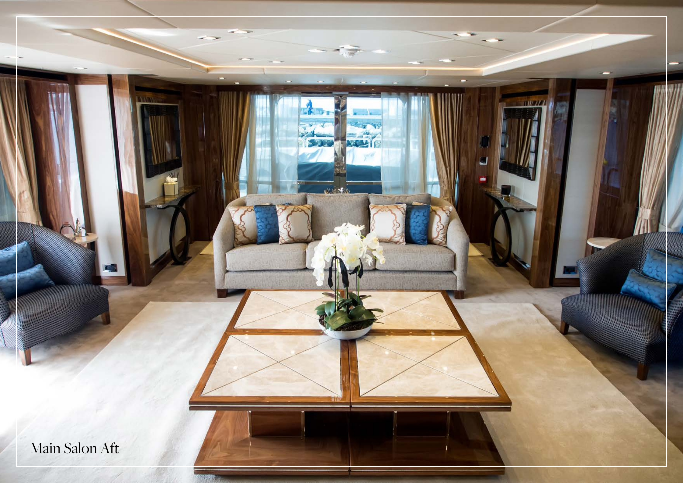
Main Salon Aft