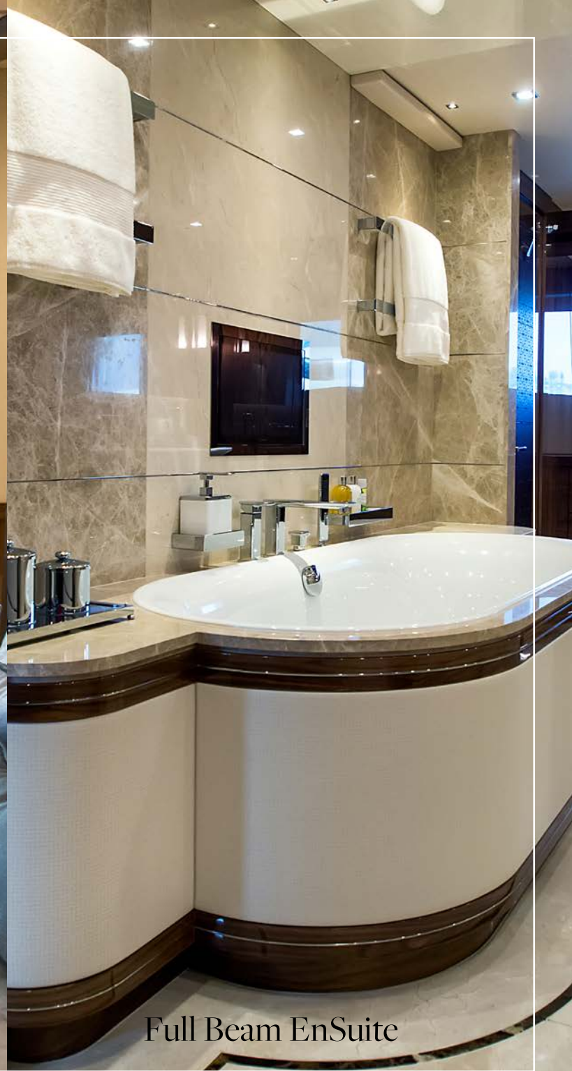
Full Beam EnSuite