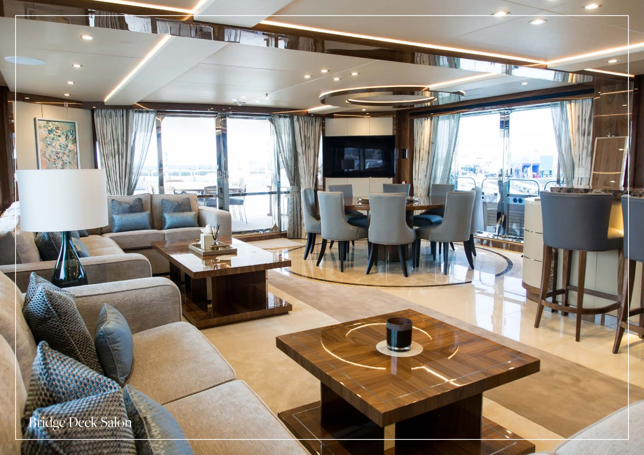
Bridge Deck Salon