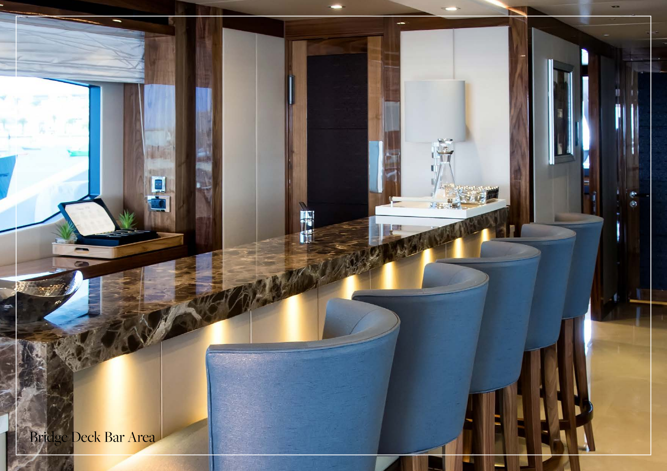
Bridge Deck Bar Area