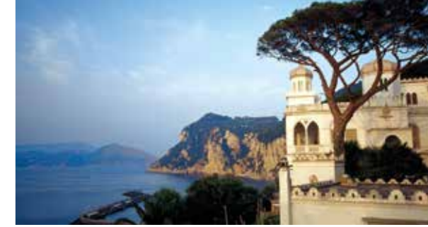
Capri Island, Italy

Meet the West Mediterranean chic in ultimate luxury. What better way to explore the golden shoreline of this number one yachting destination than onboard GO? You will quickly discover that this is the perfect transport when visiting the idyllic coves and yachting oases, as well as the many chic beach clubs, restaurants and boutiques along this glamorous coast.