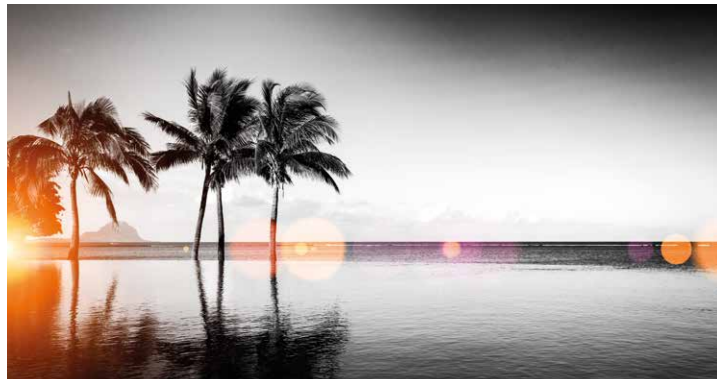
The sky is the limit