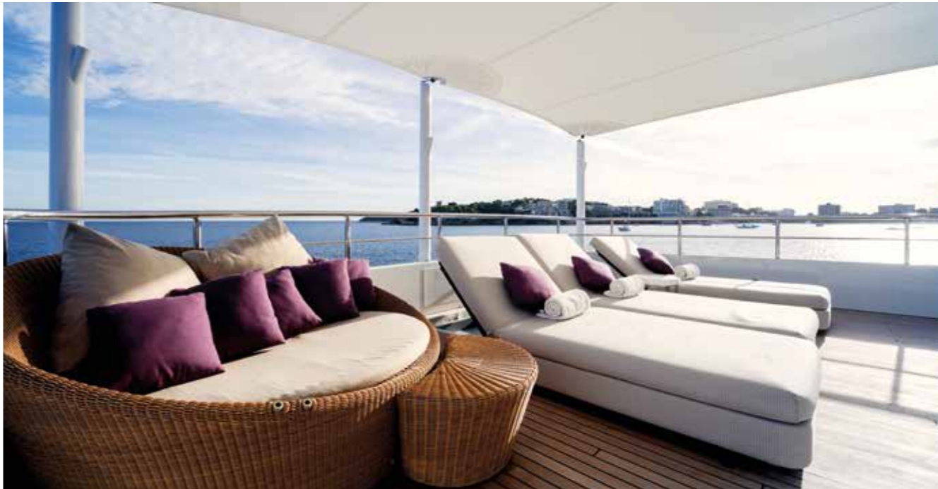
As sunny as a sun deck can get