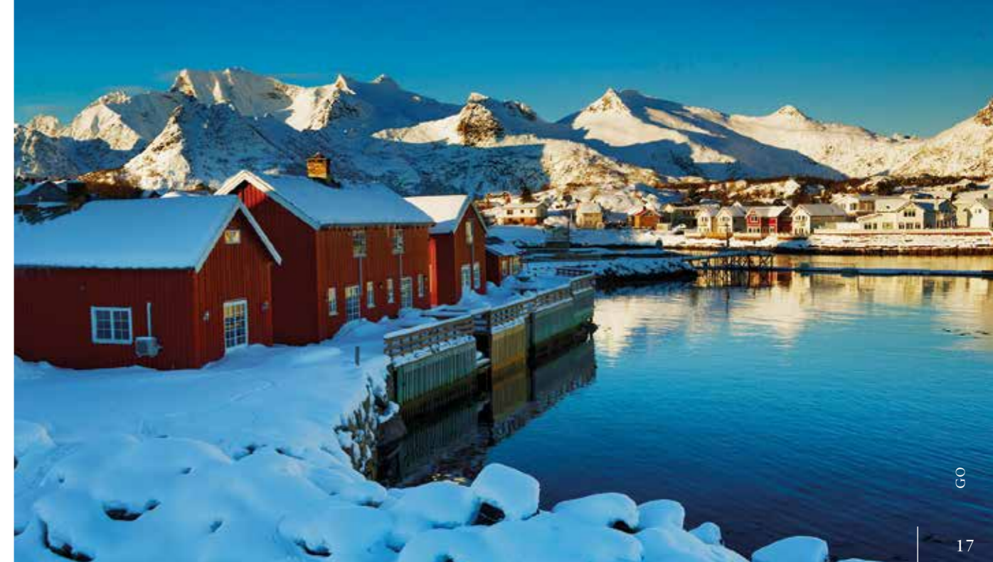
Port Kabelvag Austvagoya Lofoten, Norway