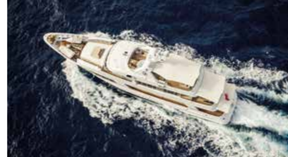
Heading towards new adventures