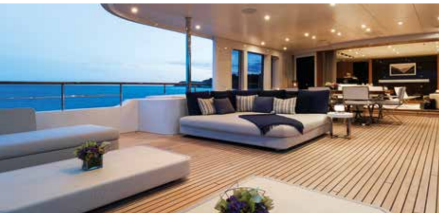
The bridge deck lounge will surely become your favourite spot for afternoon get-togethers