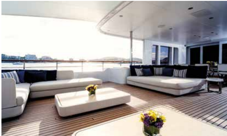
Sun sets and sundowners