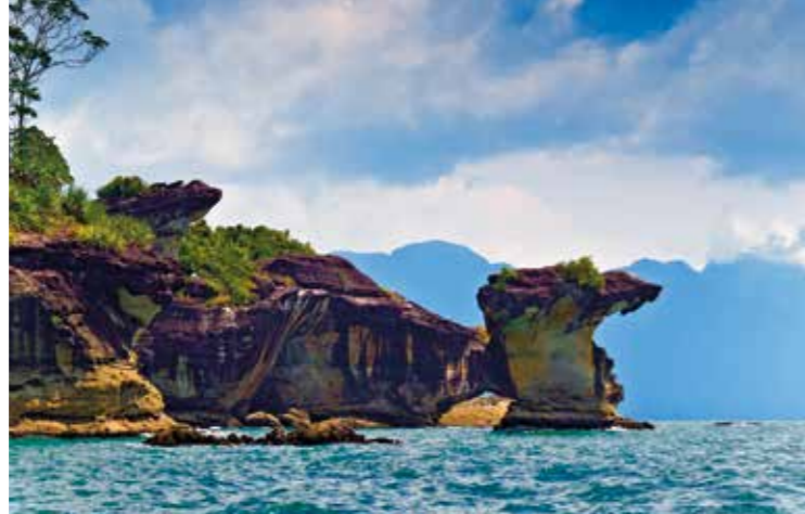
Bako National Park, Borneo, Malaysia