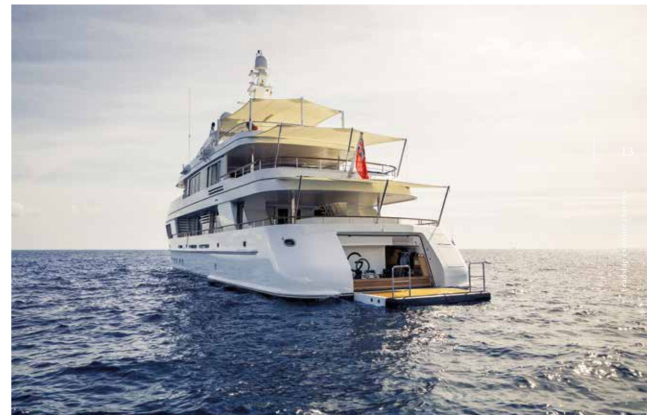
GO's swim platform - guarantee for endless fun

It doesn't matter how fantastic a place is - the way you explore it and the comfort you feel onboard will be the defining factors for how you experience your charter holiday.