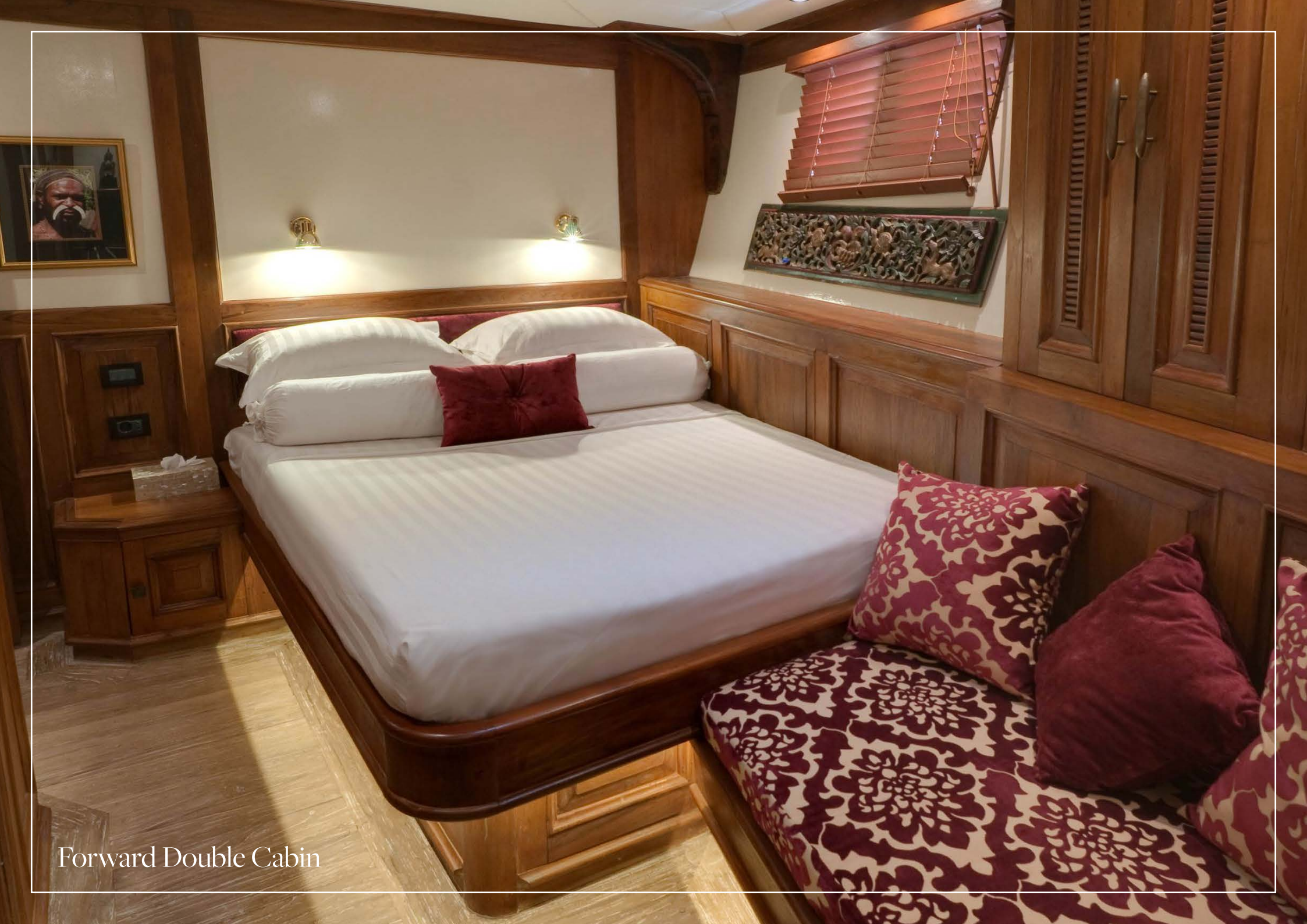
Forward Double Cabin