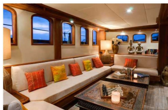
Mutiara Laut Saloon