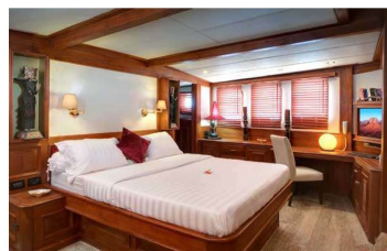
Master Suite, 1 cabin