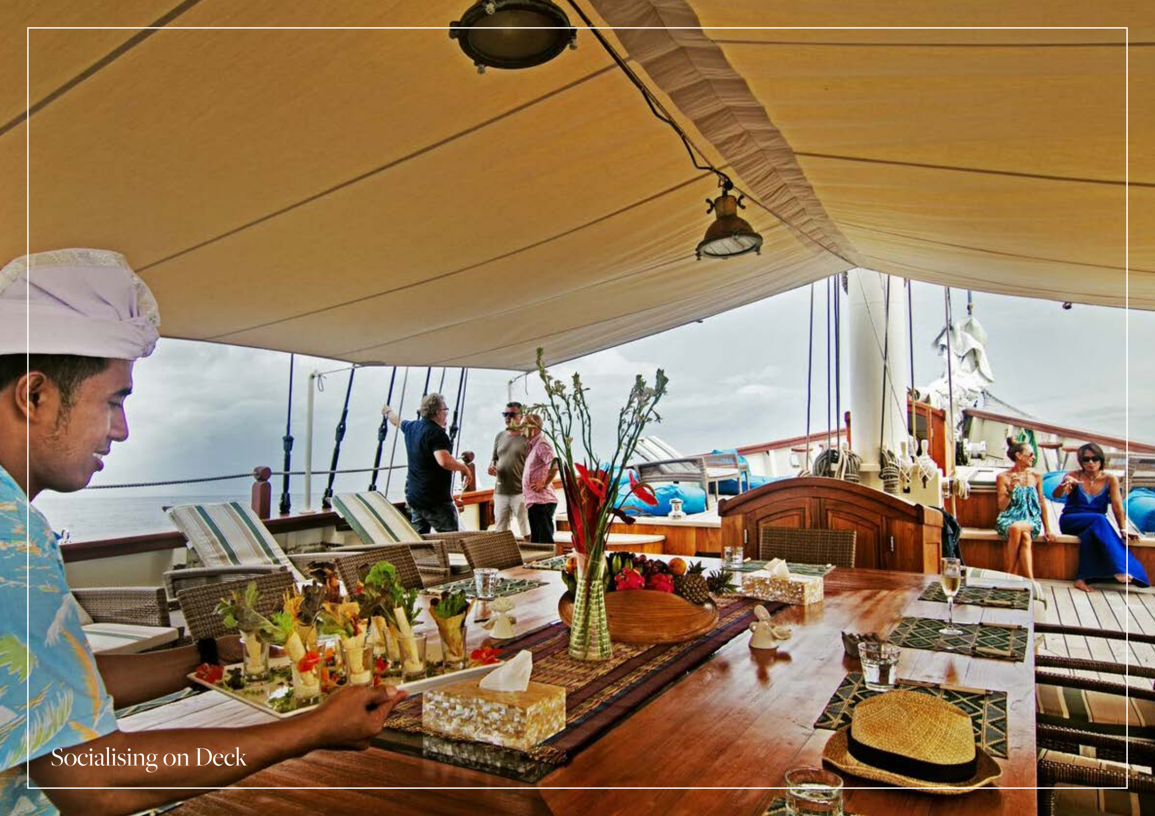
Socialising on Deck