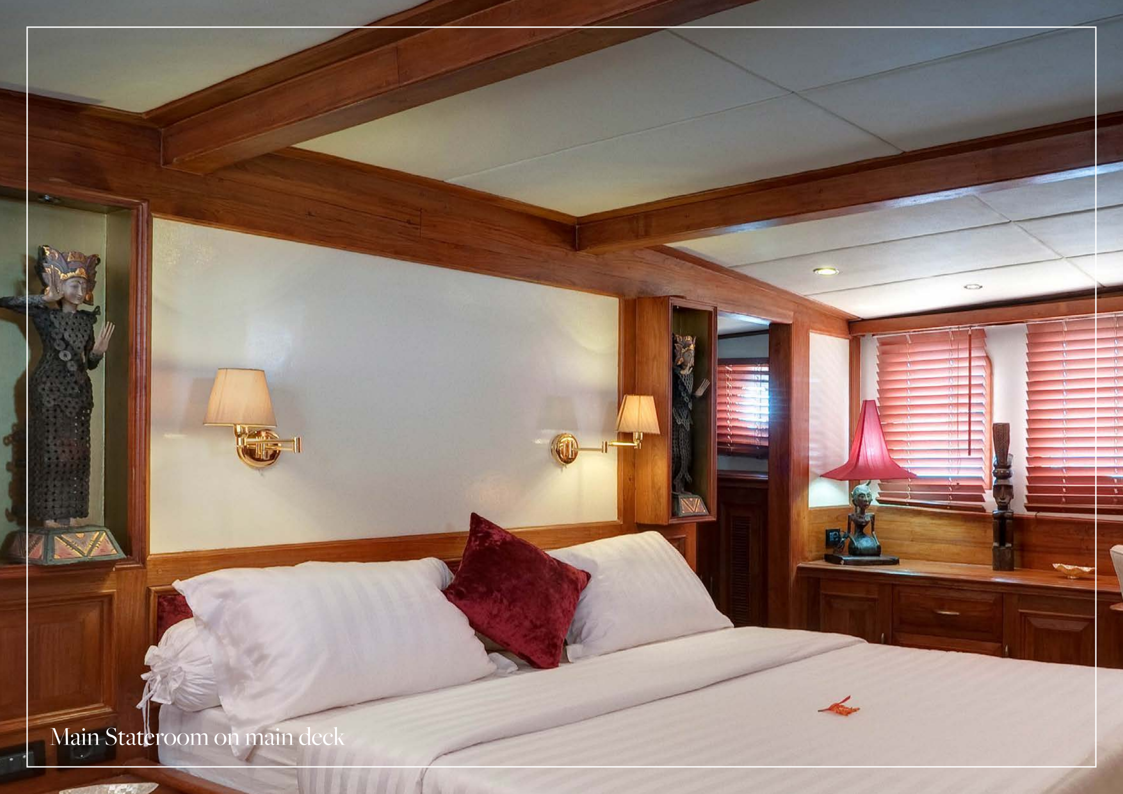
Main Stateroom on main deck