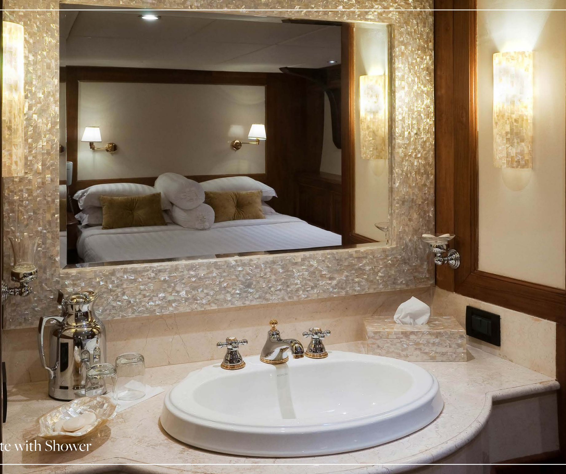
Ensuite with Shower