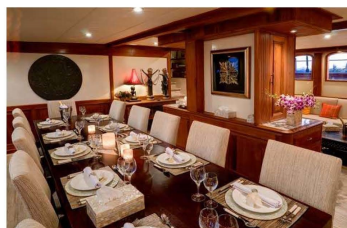
Mutiara Laut Dining