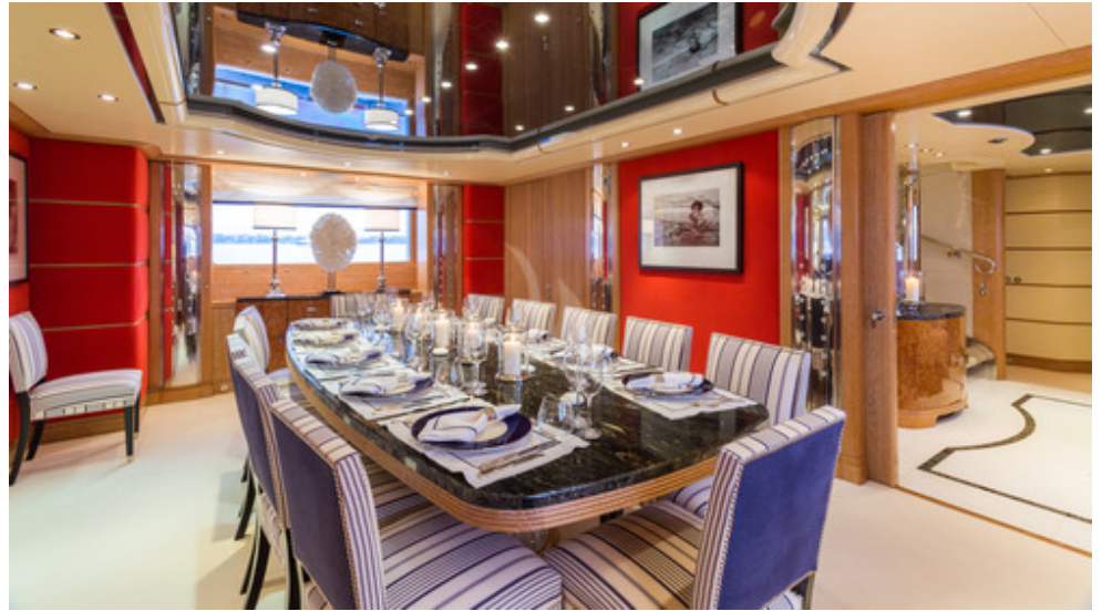
Internal Formal Dining