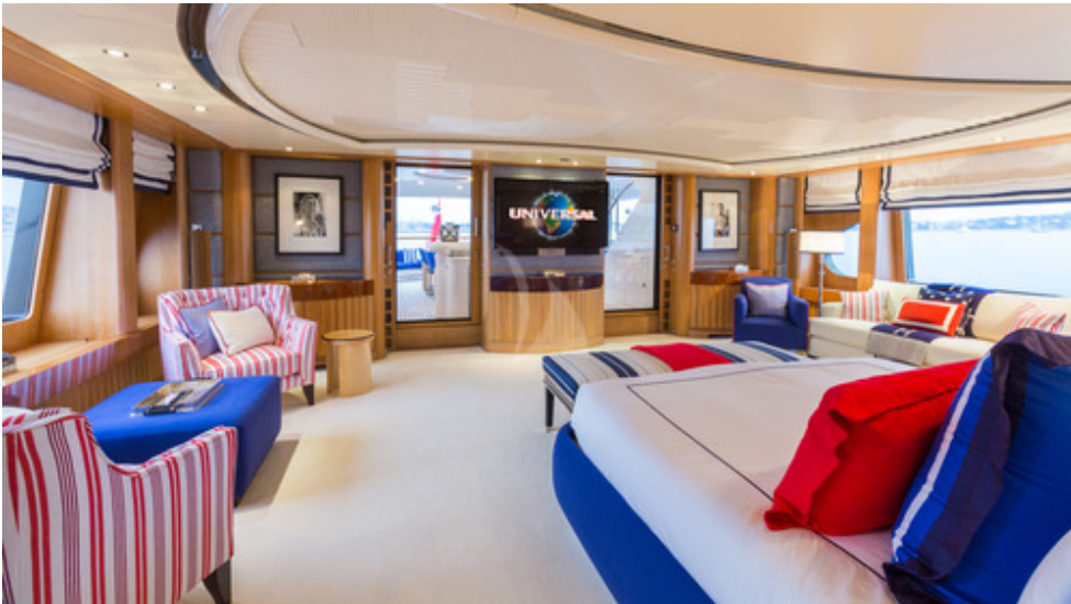
Master Cabin Bridge Deck