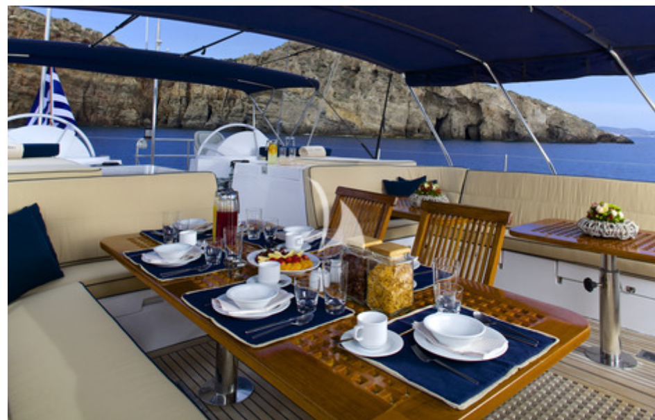
Aft sitting area another view one