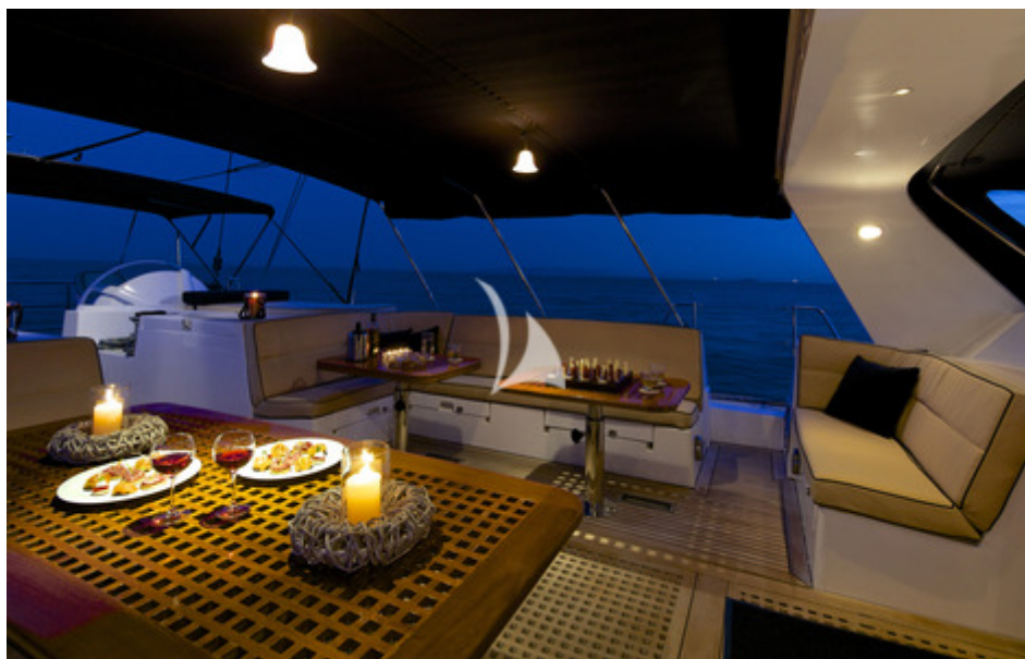
Aft sitting area night view one