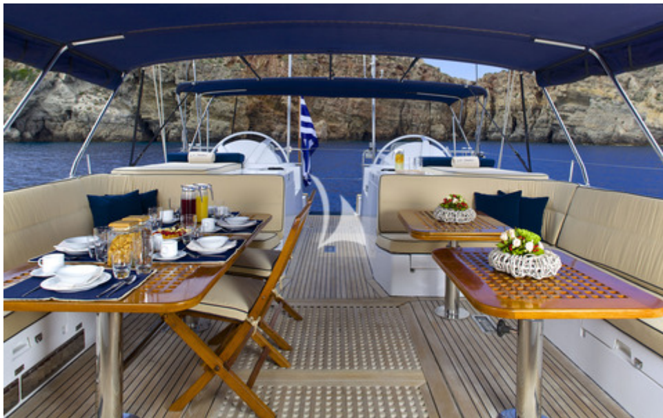
Aft sitting area