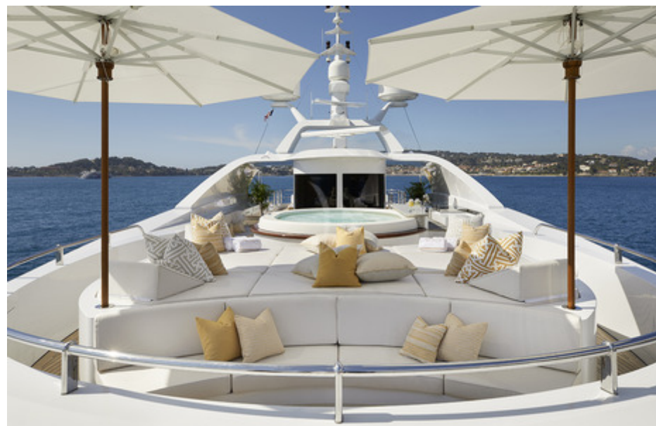
Sundeck Lounging Area and Jacuzzi