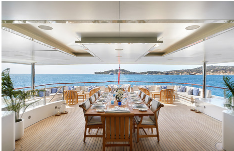
Upper Aft Deck Alfresco Dining