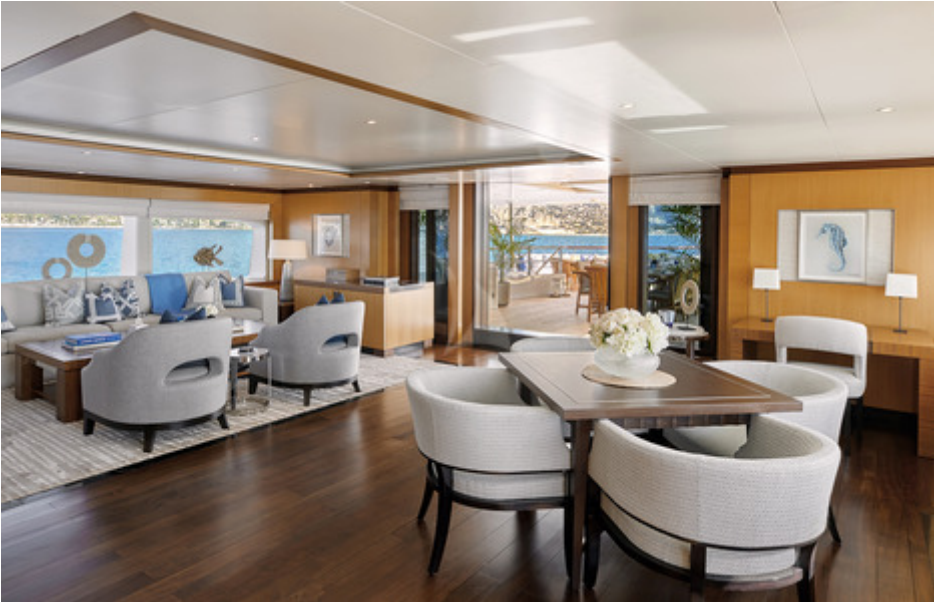
Upper Deck Lounge