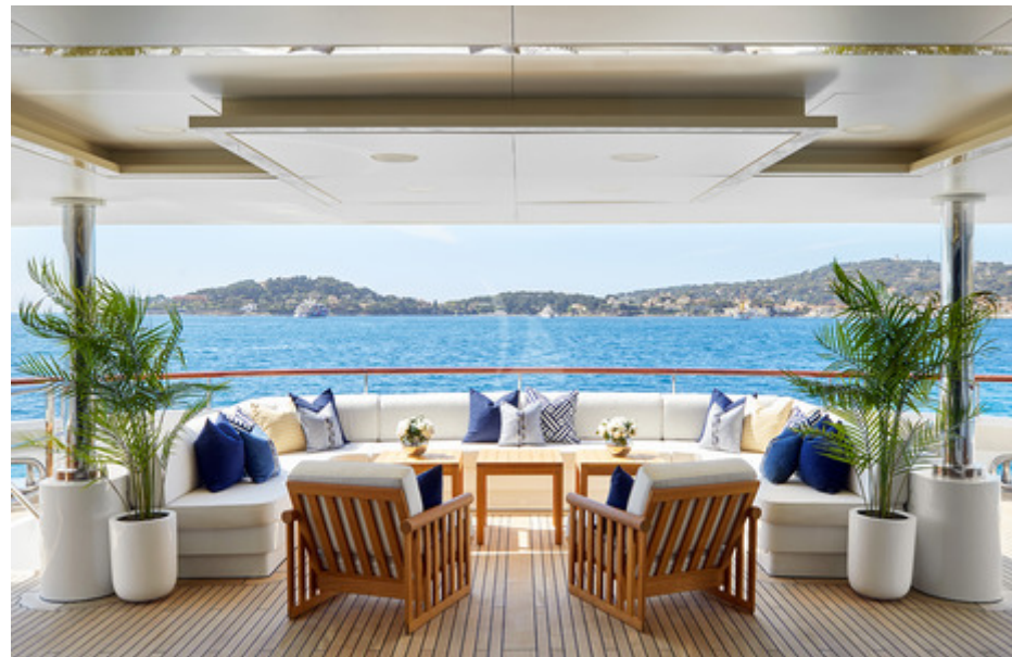
Main Aft Deck Lounge