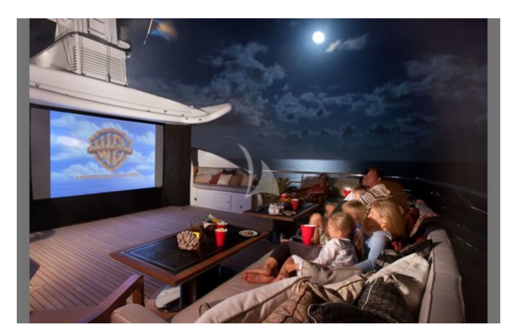
Sundeck - Cinema