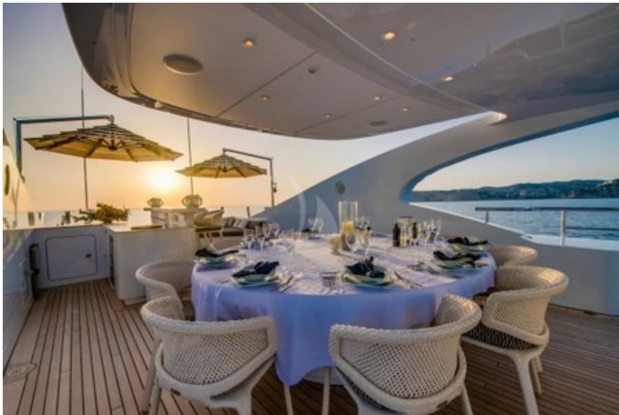
Sun deck dining