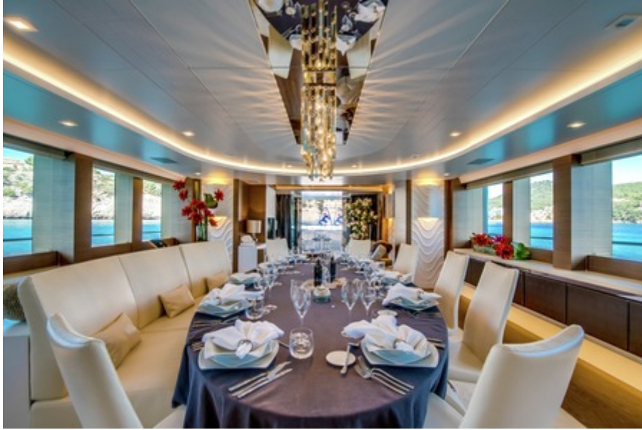
Main deck - dining