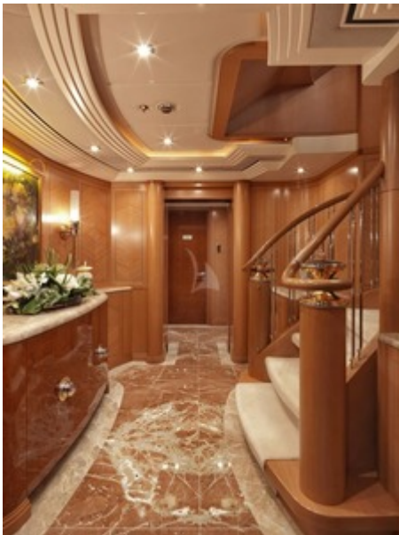
Lower deck hallway