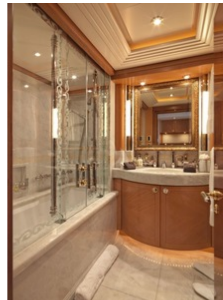
Twin Cabin Bathroom