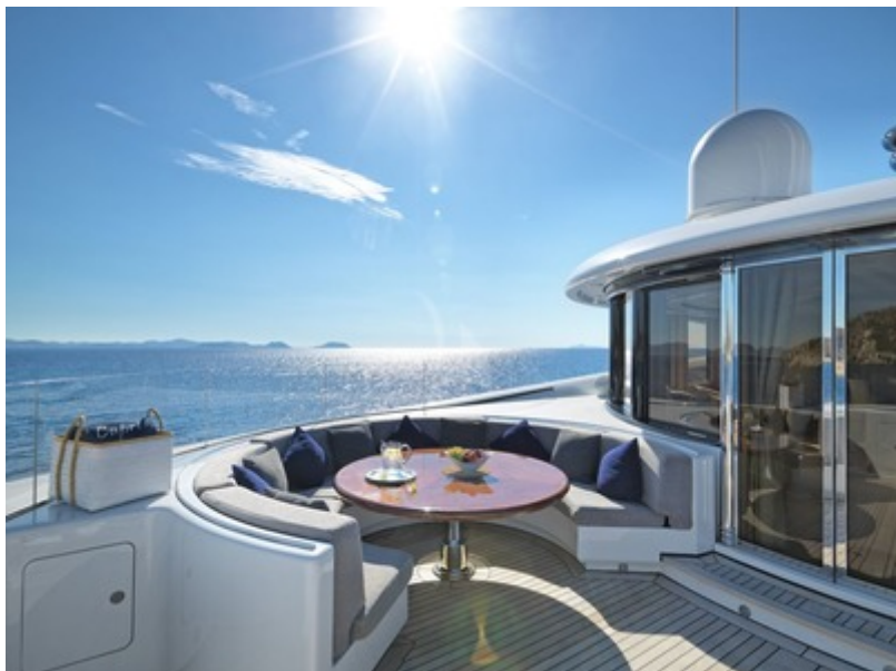
Sundeck Lounge II