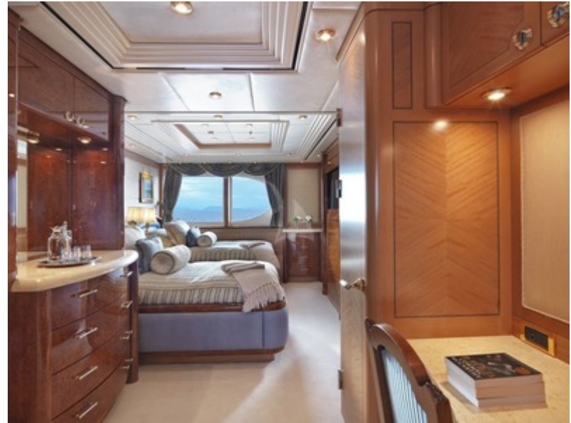
Twin Cabin on main deck