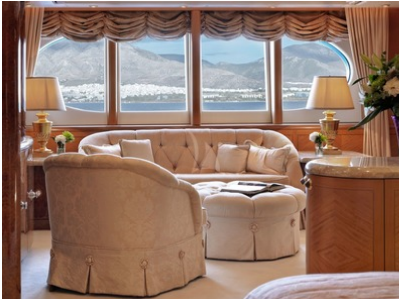
Master Cabin Sofa