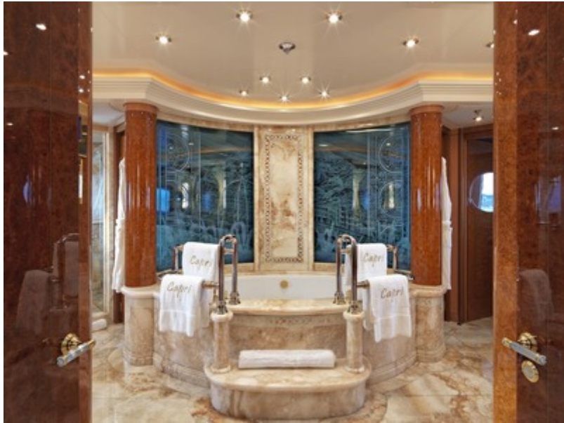
Master Bathroom Jacuzzi