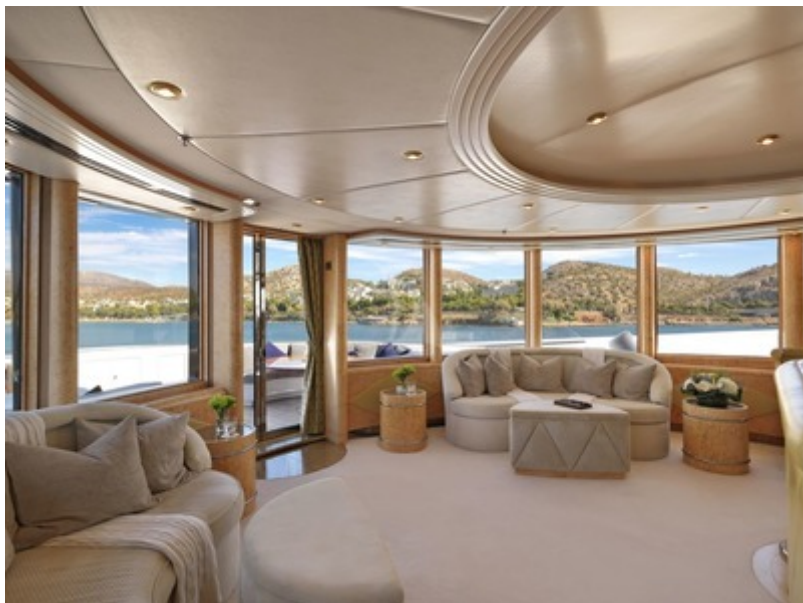
Observation deck Lounge