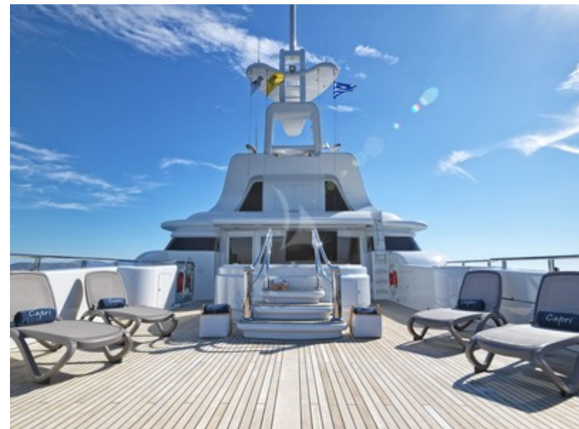
Sundeck & Jacuzzi