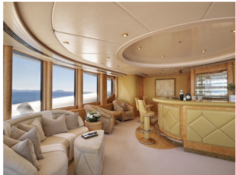
Observation deck Lounge & Bar