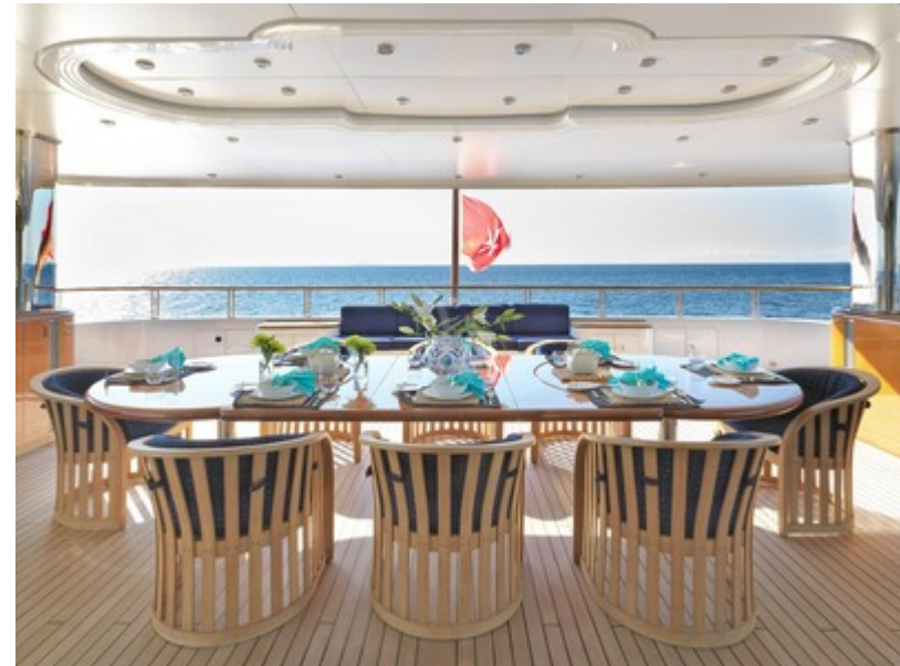
Upper aft deck dining