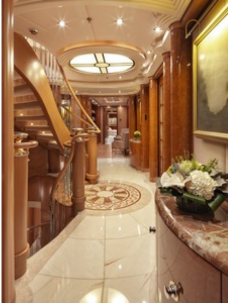
Main deck hallway