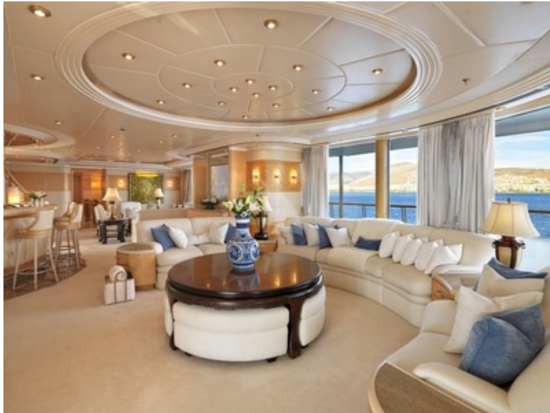
Upper deck Saloon