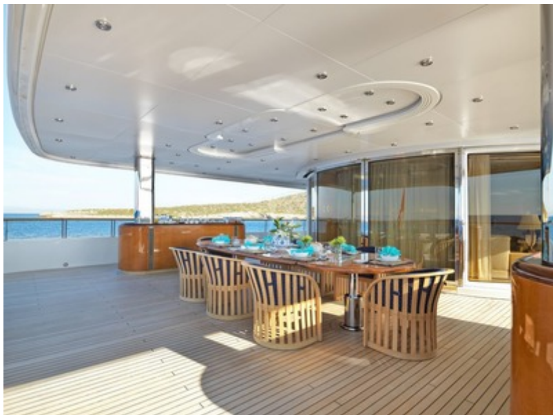
Upper aft deck dining II