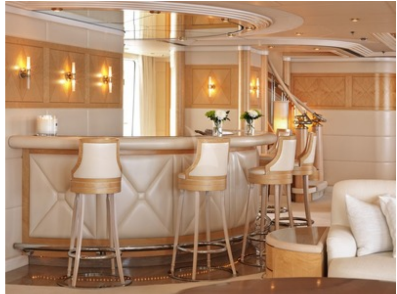
Upper deck Bar