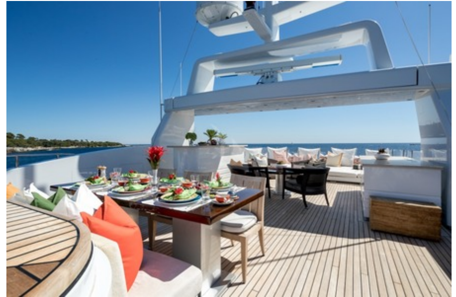
Clicia - Sun deck