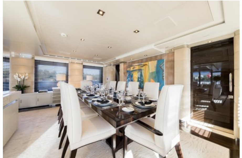
Clicia - main deck dining