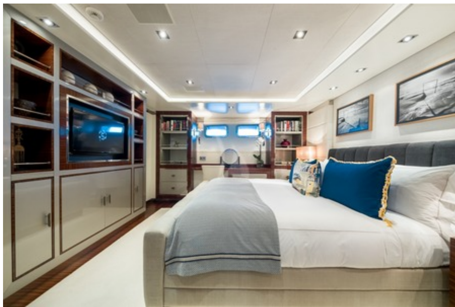
Clícia - VIP (2)