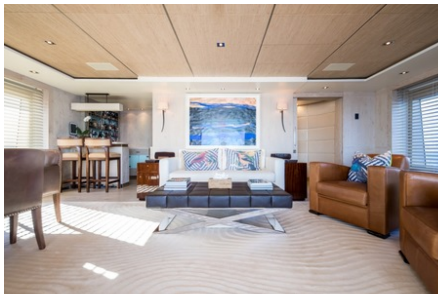
Clícia - skylounge