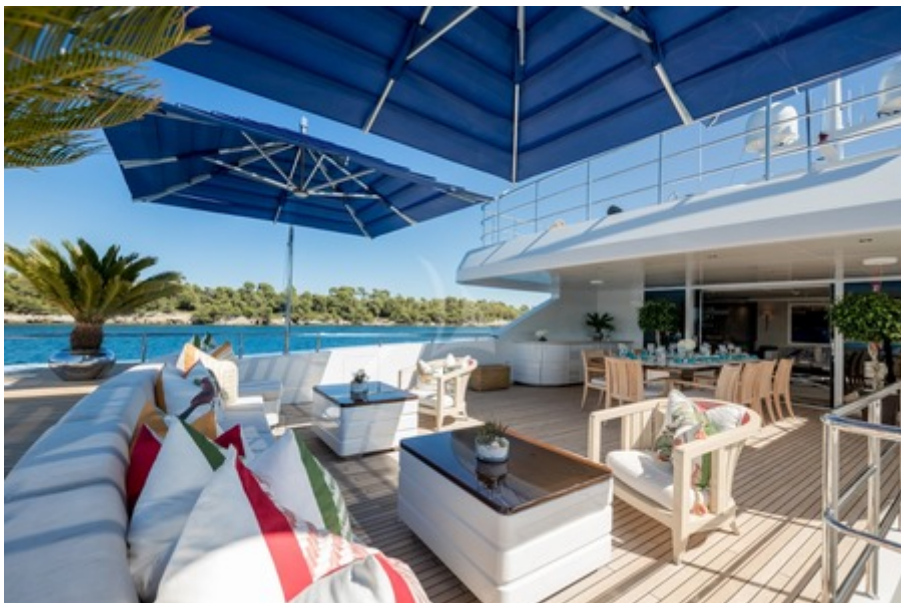
Clicia - middle deck