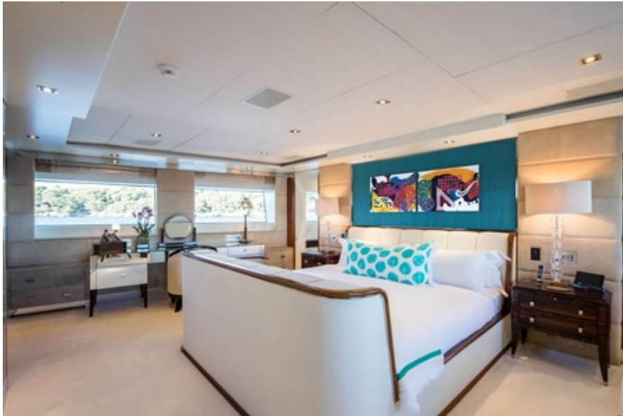
Clicia - Master stateroom