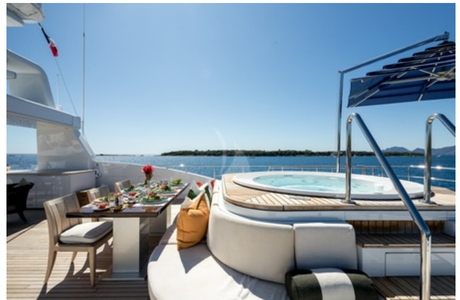
Clicia - Sun deck Jacuzzi