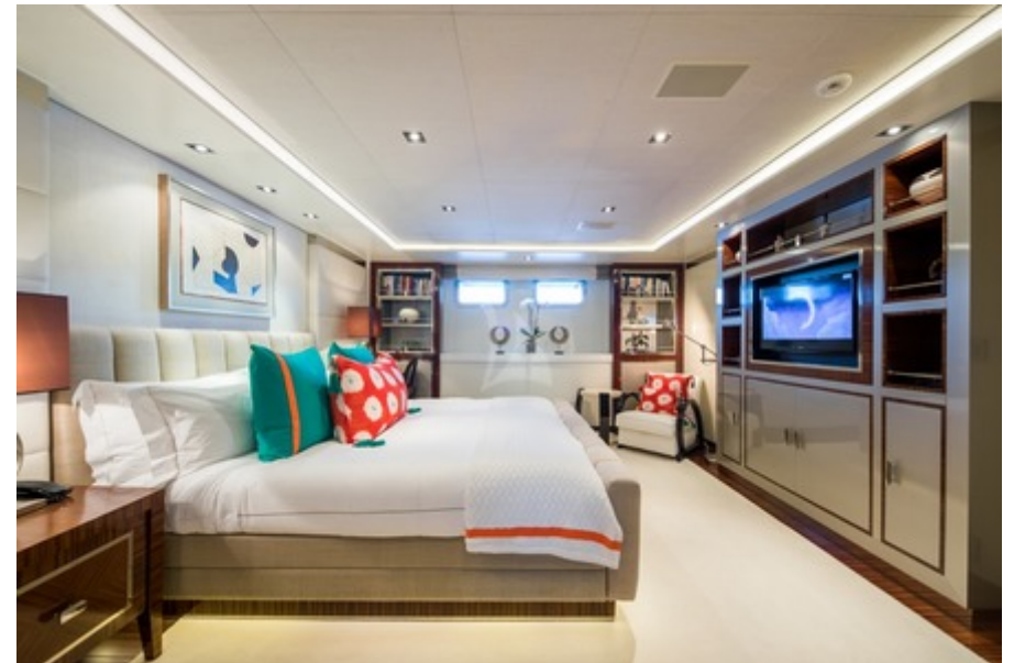
Clicia - VIP (1)