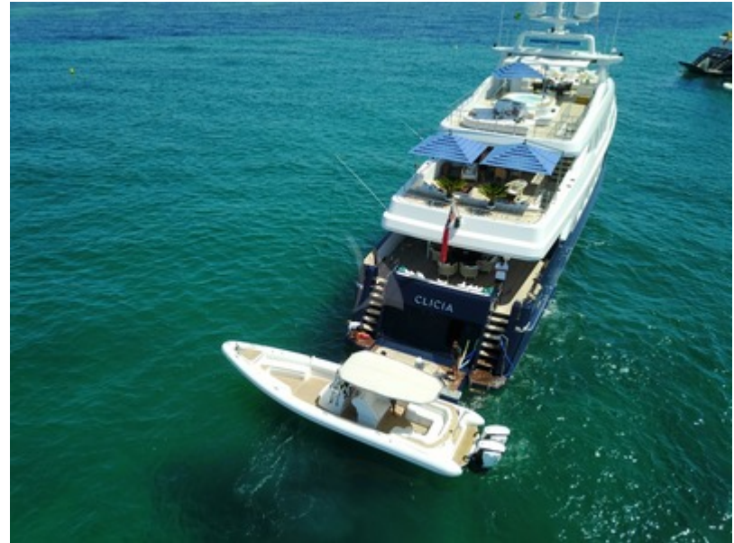
Clicia - At anchor