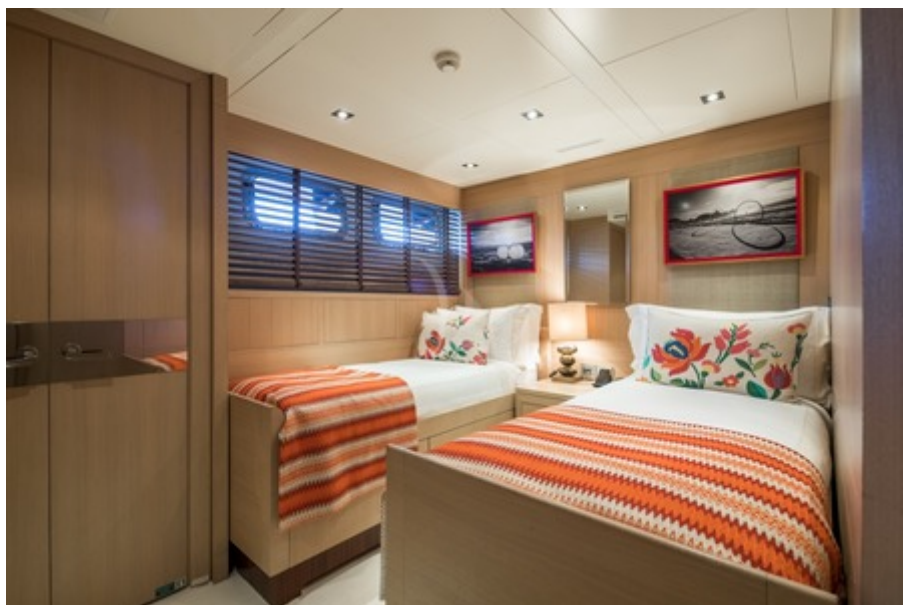
Clícia - convertible twin