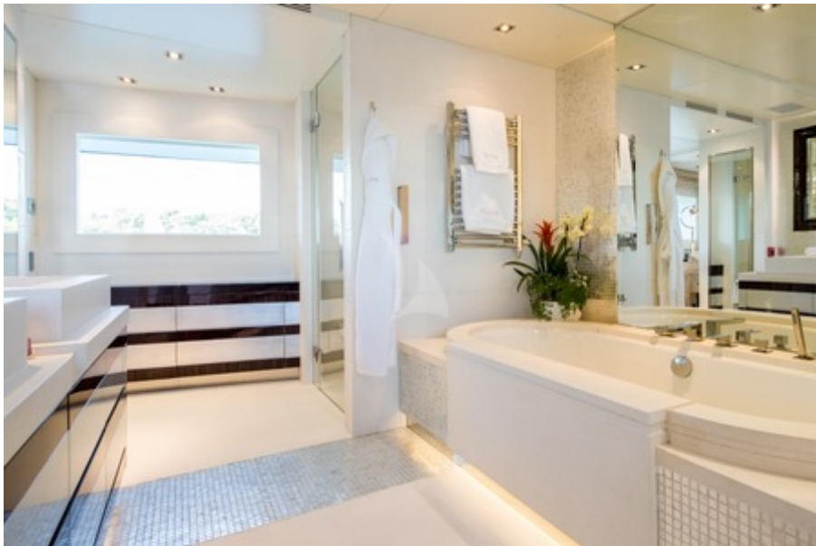
Clicia - Master bathroom