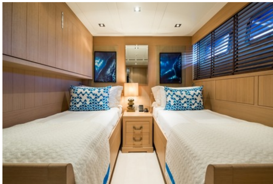
Clícia - twin with pullman