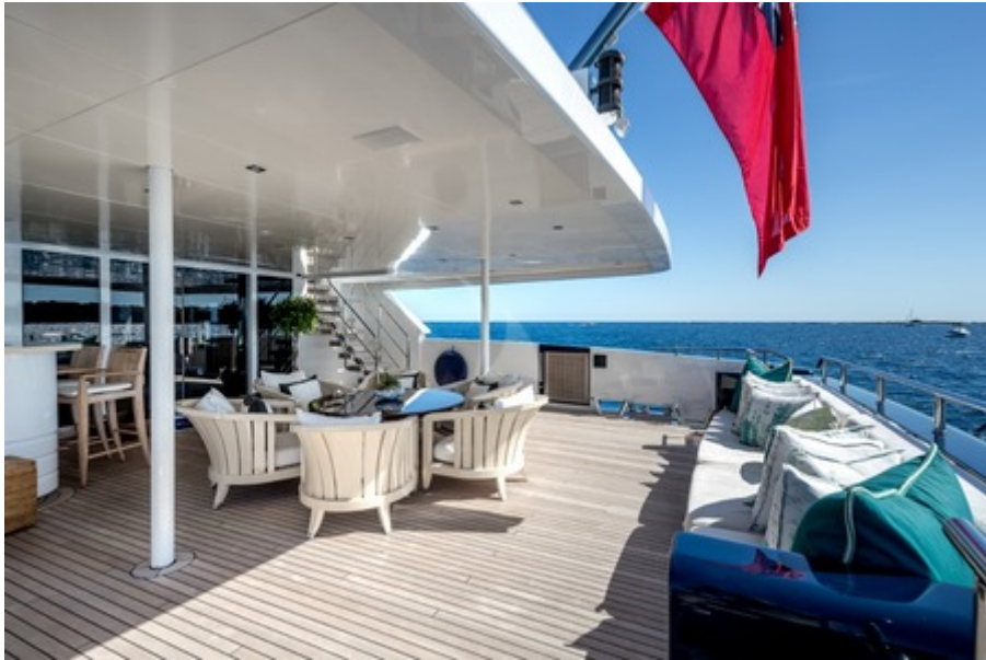
Clicia - aft deck