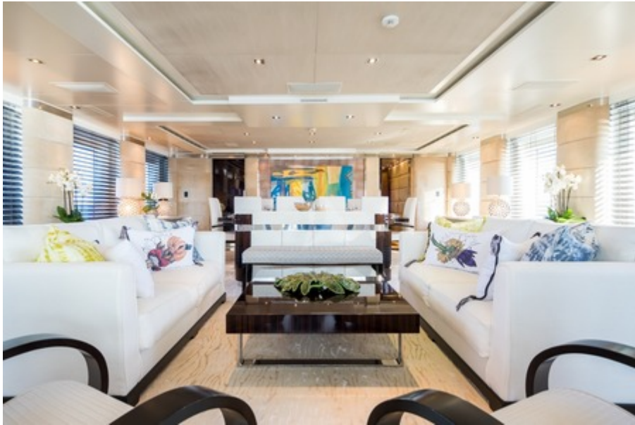
Clicia - main saloon