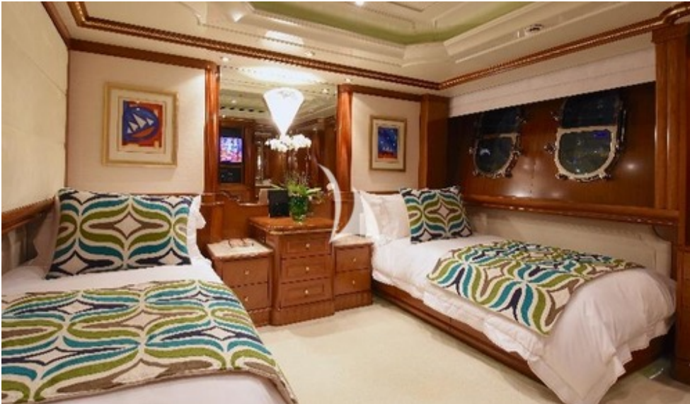
Twin guest cabin