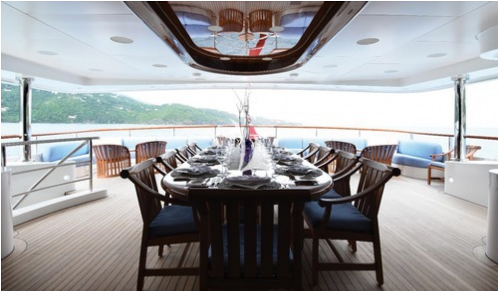
Bridge deck dining