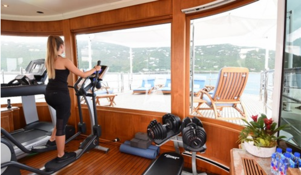
Sun deck gym