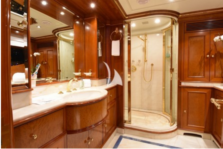
Master en suite