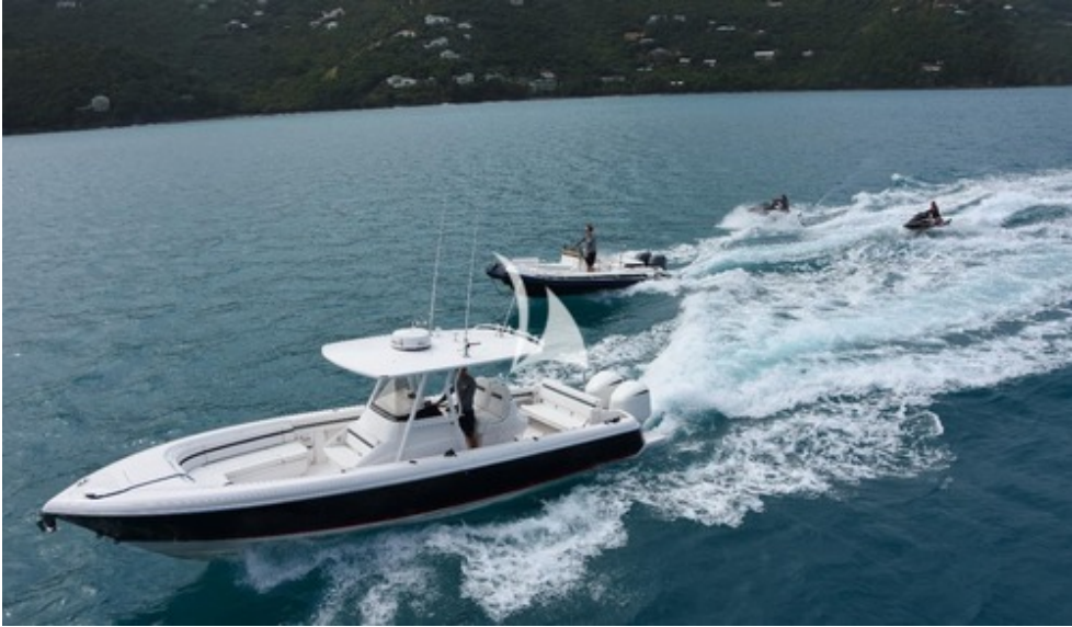
Tender & toys