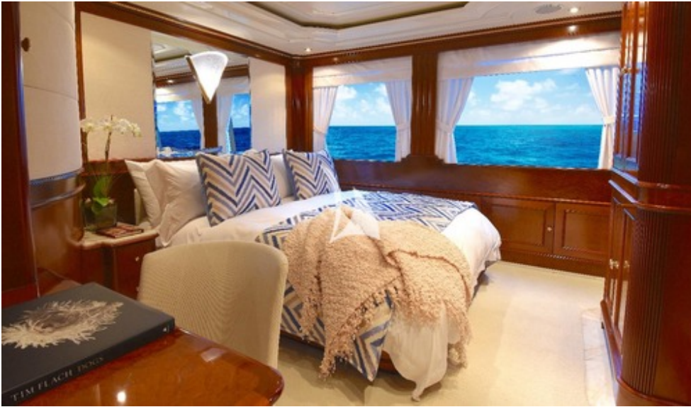
Double guest cabin