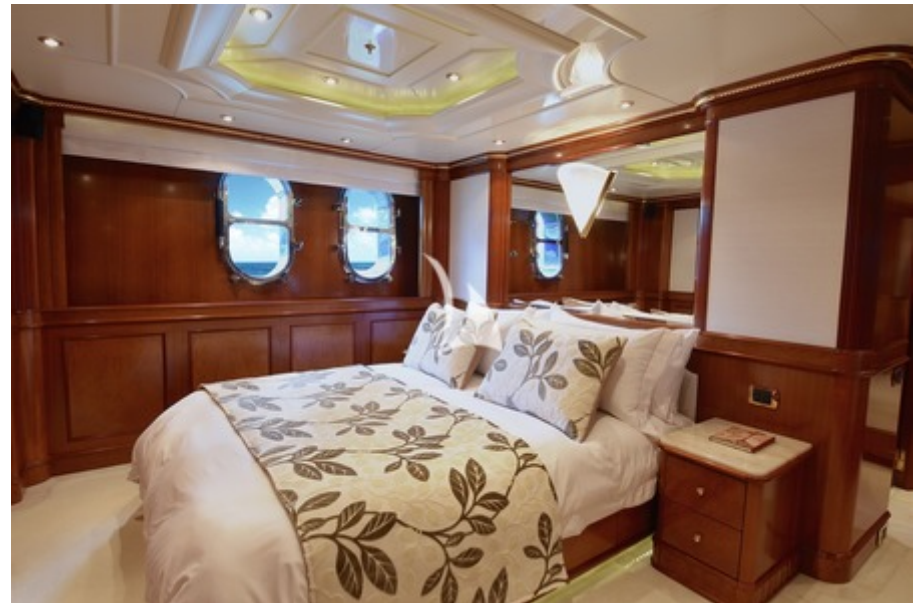
Double guest cabin