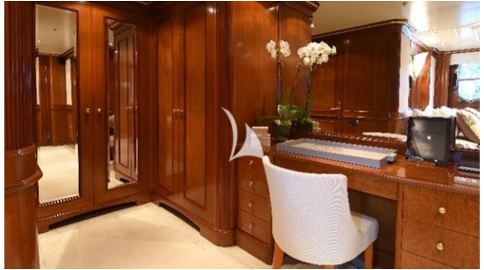
Guest cabin desk