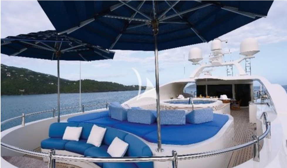
Sun deck view aft