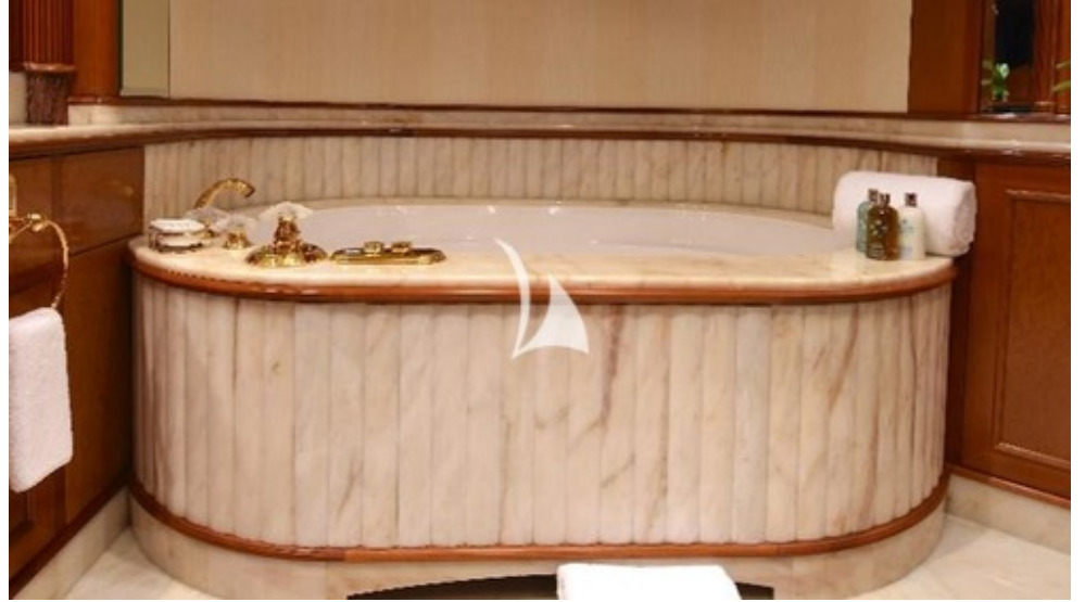
Master en suite