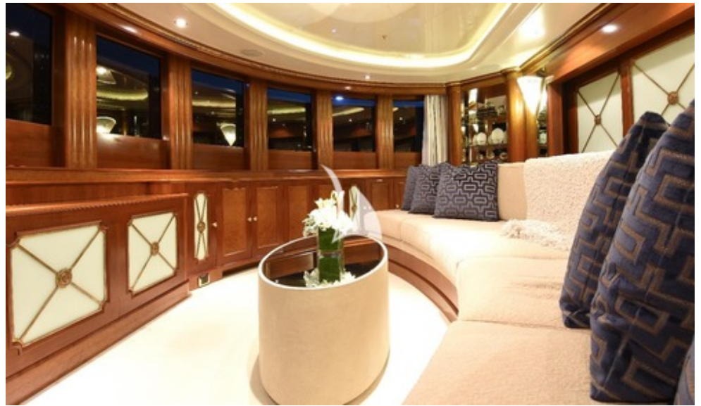
Master cabin private observation