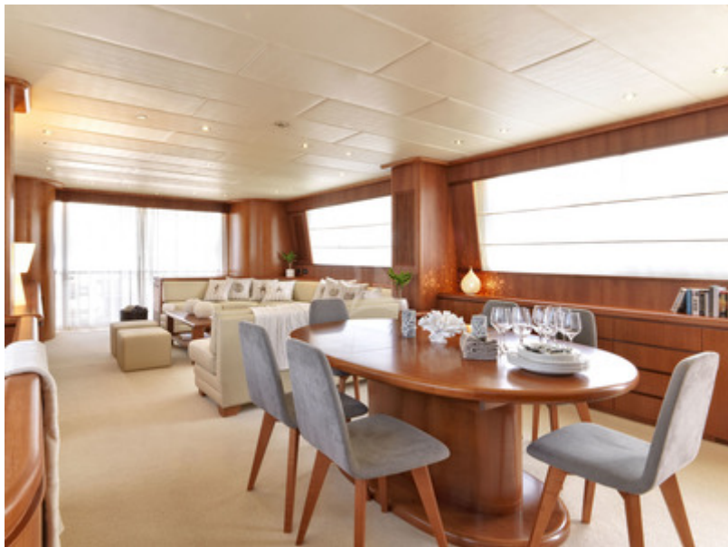
Salon & Dining Area