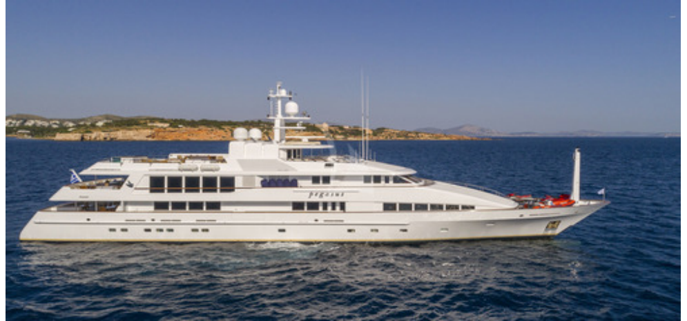
Pegasus Cruising 1