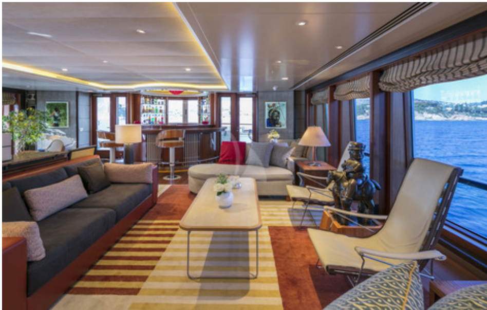
Upper Deck Salon 3