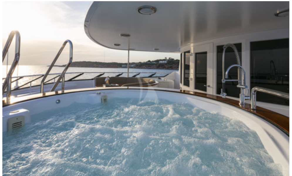
Sun Deck Jacuzzi 2