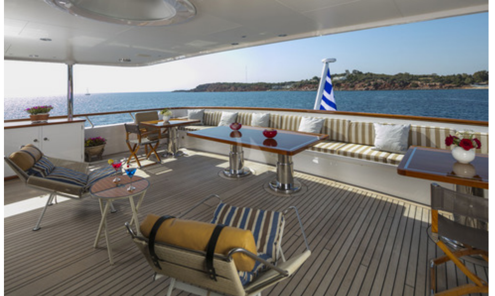
Upper Deck Aft 2