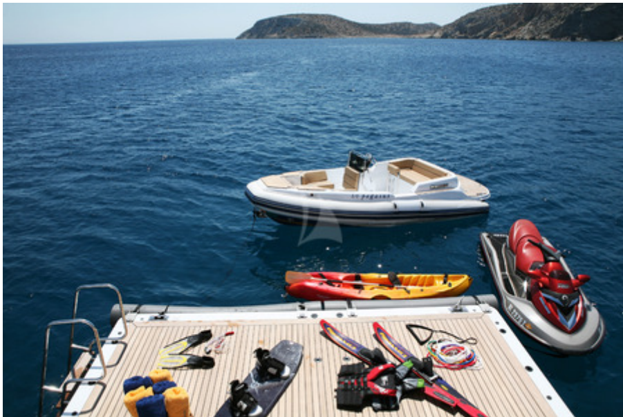
Water Toys 2