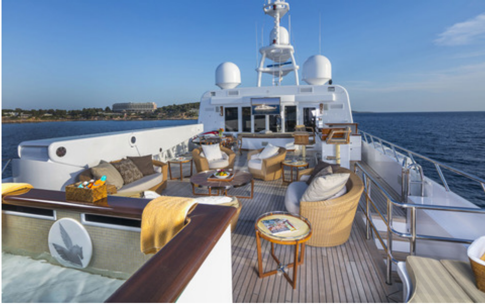
Sun Deck Plunge Pool 1