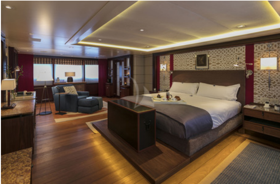
Master Suite 2