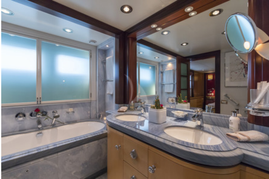
Twin Stateroom Bath