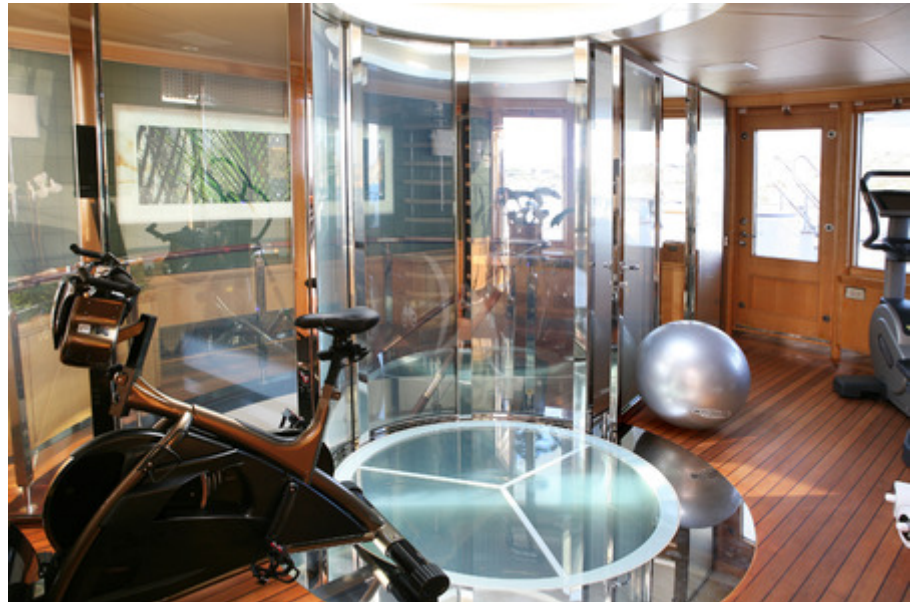
Gym on Sundeck