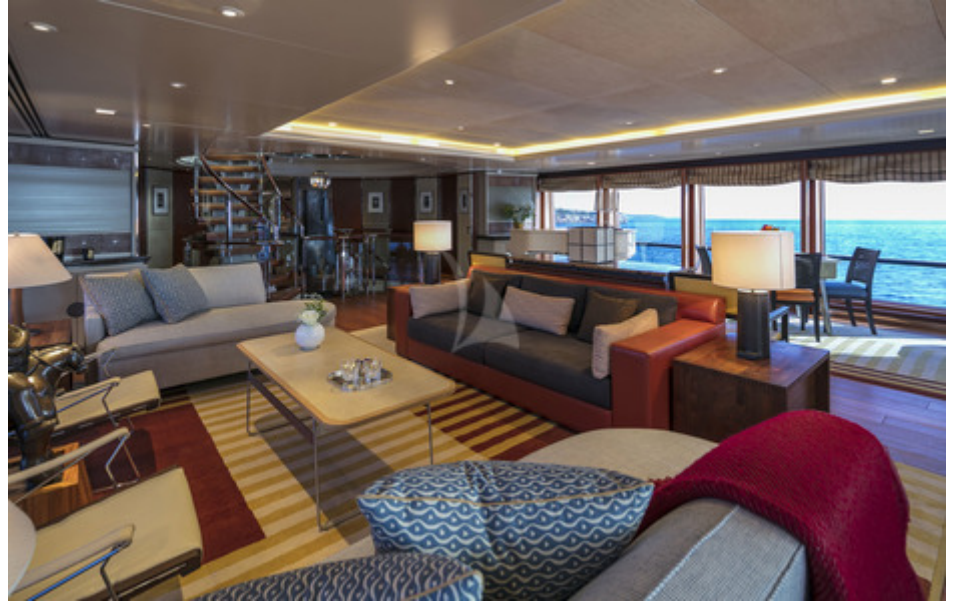
Upper Deck Salon 2