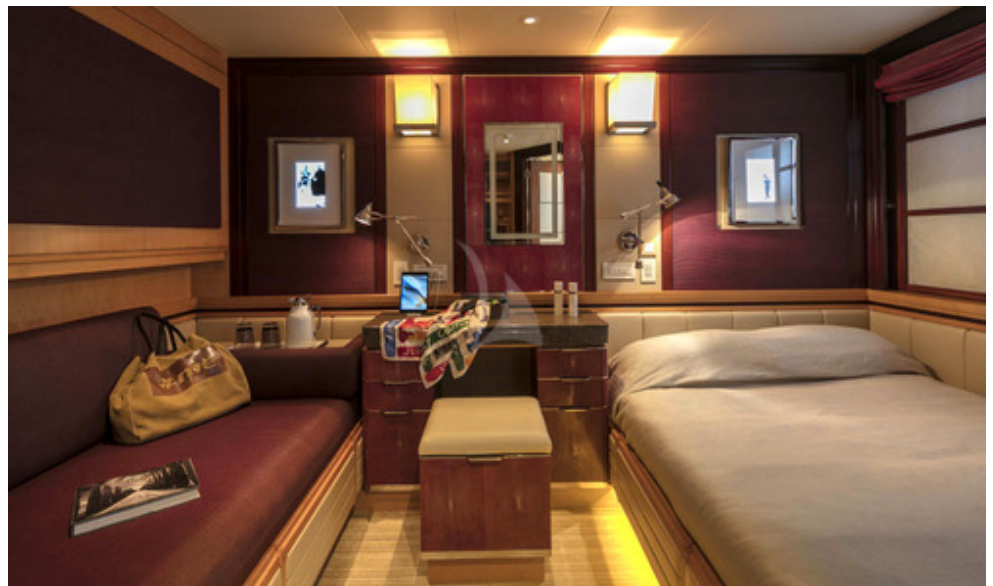
Twin II Stateroom 2