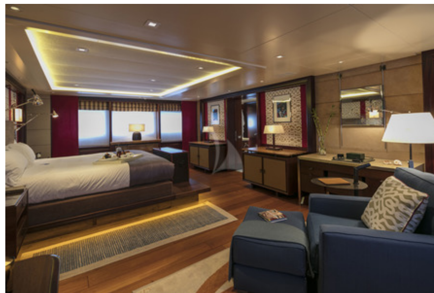
Master Suite 1