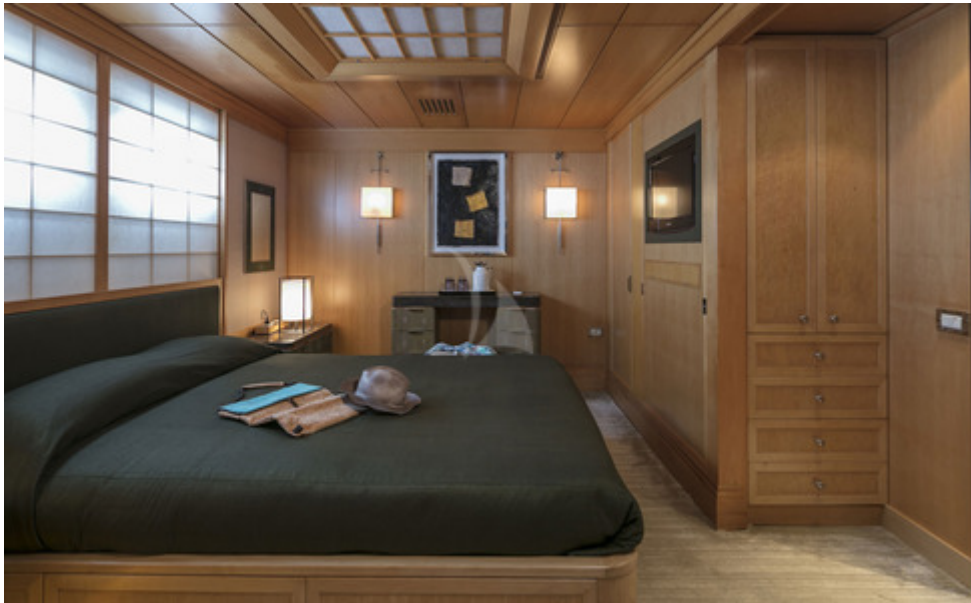
VIP II Suite