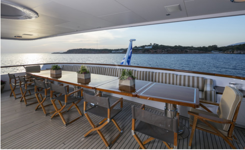
Upper Deck Aft 1