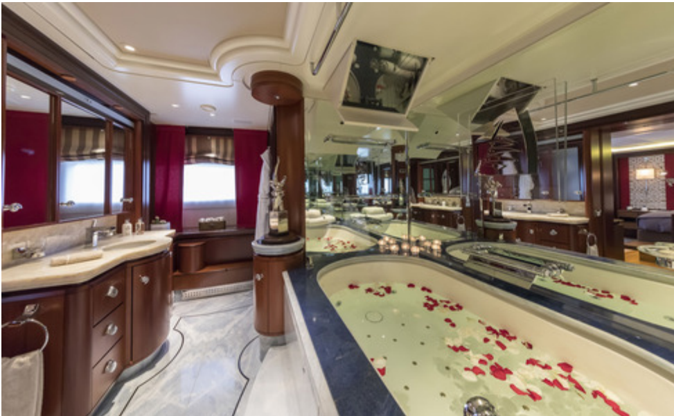
Master Bath TV