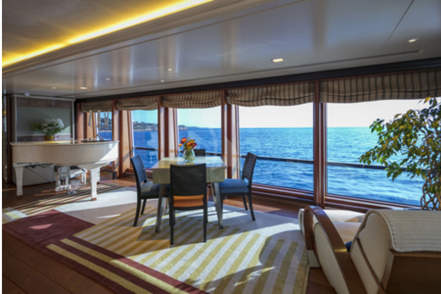
Upper Deck Salon 1