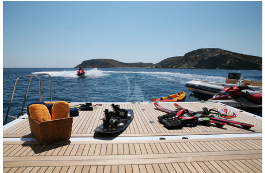
Water Toys 3