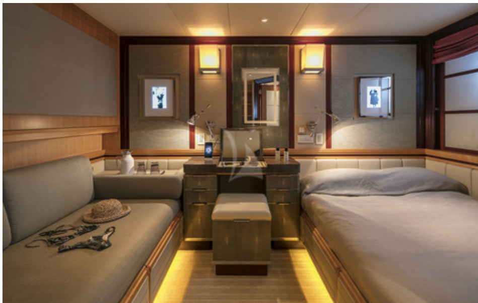
Twin II Stateroom 1