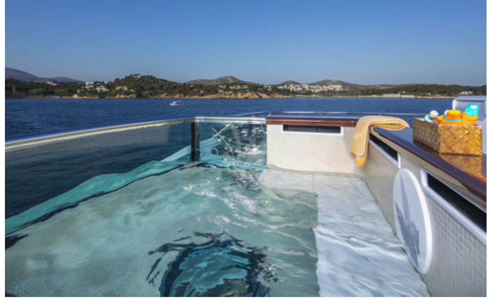
Sun Deck Plunge Pool 2