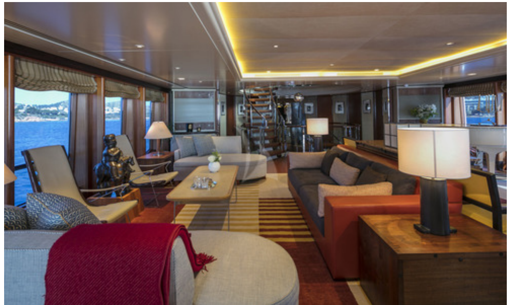
Upper Deck Salon 4