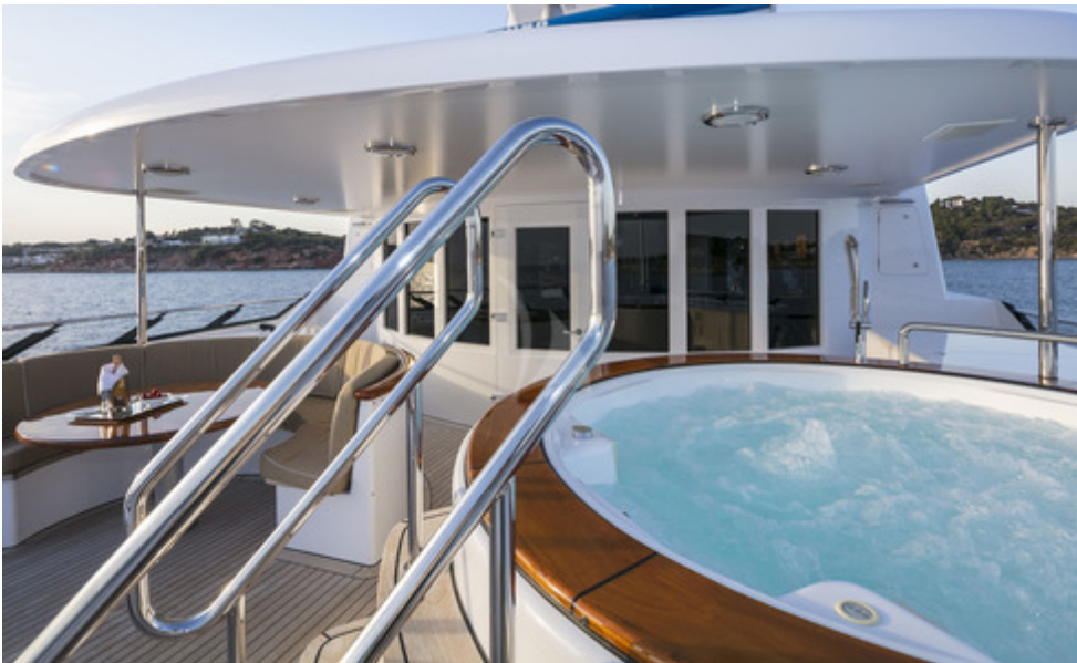
Sun Deck Jacuzzi 1