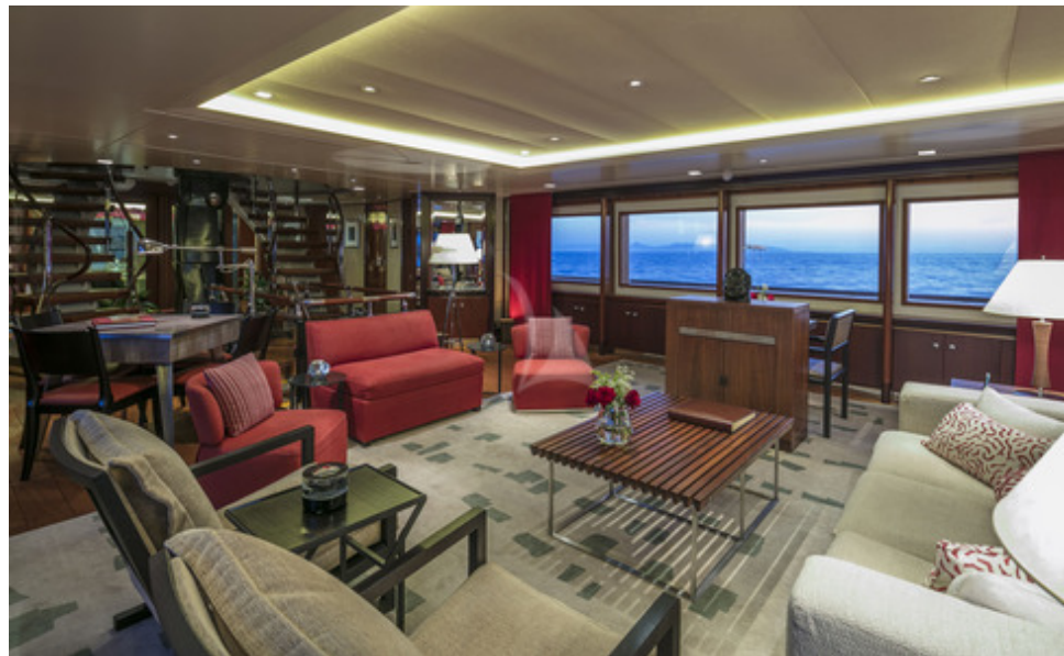
Main Deck Salon 2