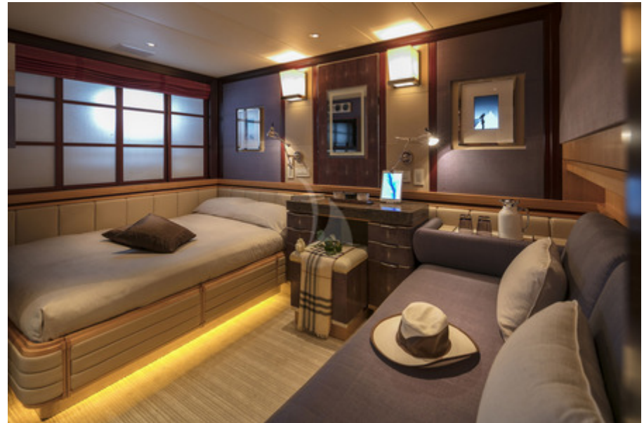
Twin I Stateroom 2