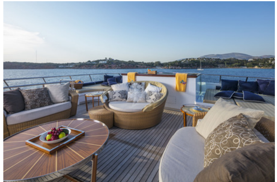
Sun Deck deck Aft