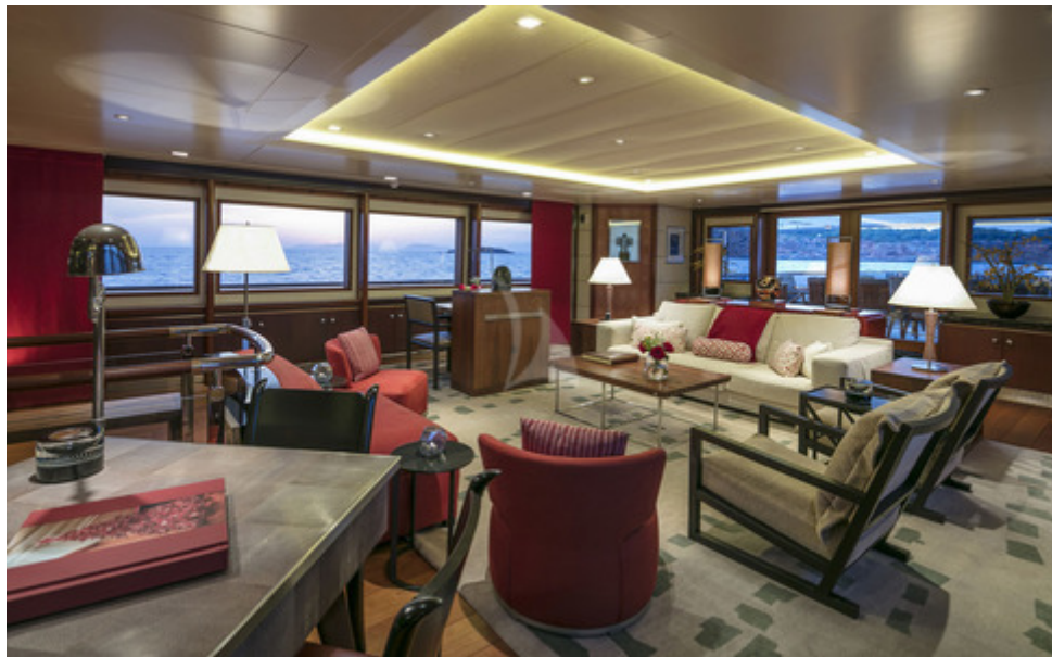
Main Deck Salon 1