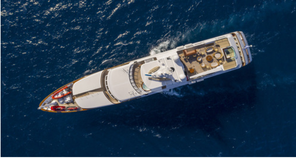
Pegasus Aerial View