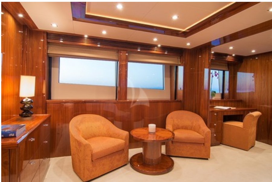
VIP seating area