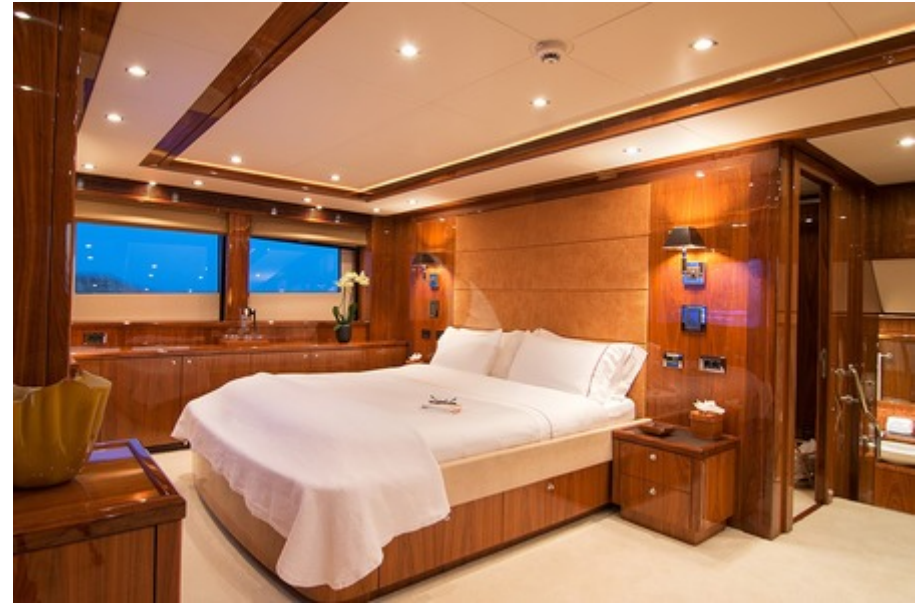
VIP Suite 2