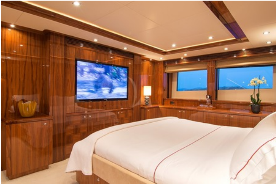
VIP Suite 1